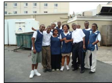
Some members at last years trip!

So by now I'm sure you're wondering how you can sign up? Easy! Just make sure to attend a general meeting or contact an executive member!